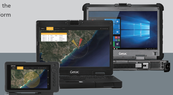
Getac MX50 Fully Rugged Tablet